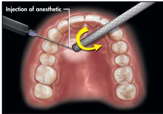
Figure 3. Illustration demonstrates “press and roll” of the mirror handle while the needle is simultaneously injected.