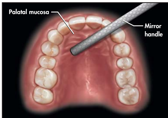
Figure 1. Diagram conveys how to apply pressure to palatal tissue with mirror handle.

The resultant palatal anesthesia technique should yield adequate palatal anesthesia in a comfortable manner for the patient.